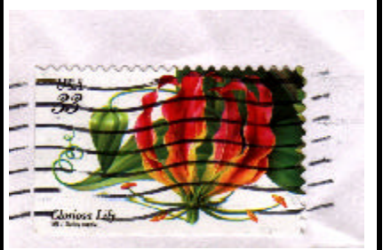
Collect stamps for charity! Please trim them first, but remember to leave about a half inch of envelope on all sides of the stamp. This one could use more on the left and bottom sides.

A small prize will be given to the person who donates the most stamps by the March meeting. The reason being is there a competition between the chapters to participate in the program at the Region 2 Summit. The winning chapter receives an award. We won Third Place in the Stampede competition in both 1998 and 1999. Furthermore, an annual award will be given as well. Stamp donations will be measured by weight, not by the number of stamps.