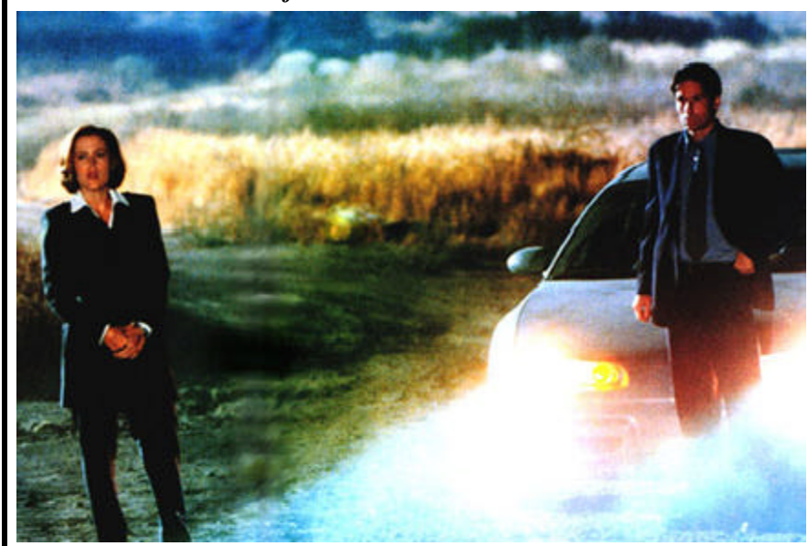
A scene from the new X-Files movie.