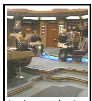
Another snapshot from ET shows the bridge of the new Enterprise.

Voyager will pop up as the Enterprise 's emergency holographic doctor. Alice Krige is also slated to join the cast in the role of the Borg Queen. All seven TNG regulars were signed to do the movie. Although many plot details remain sketchy, First Contact will feature the enigmatic Borg race as the main foes. In fact, the first trailer for First Contact appeared in theaters in late May. It simply featured a Borg ship and the caption "The Borg is back November 22<sup>nd</sup>".